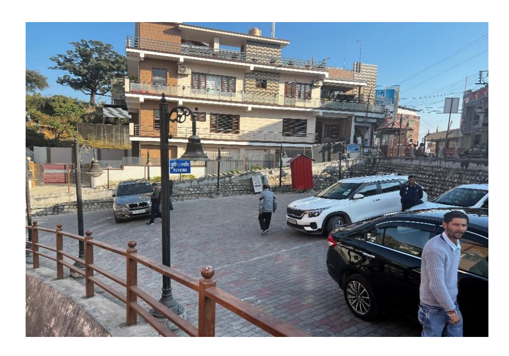
Upper Terminal Point (UTP): and the Upper Terminal Point (UTP) is near entry point of Chintpurni Temple near Mundan Hall