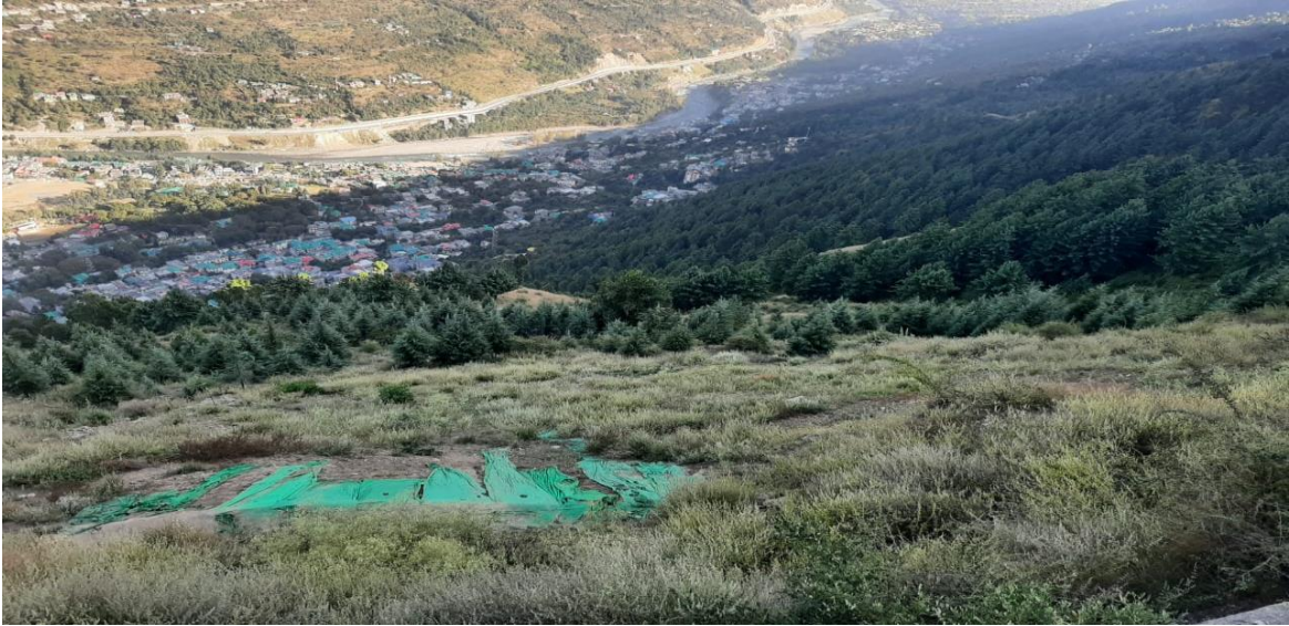
Figure 24: Proposed UTP