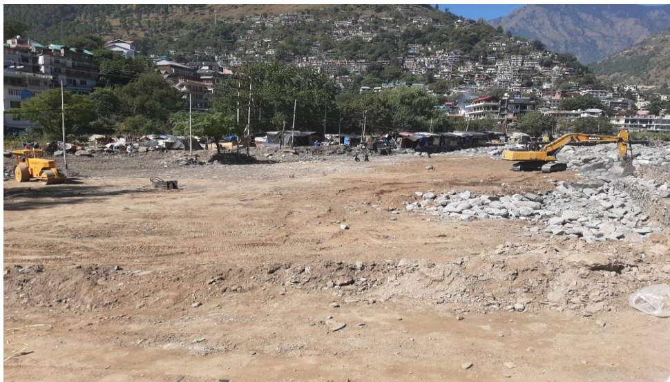
Figure 23: LTP

The proposed station would be a bridge type ropeway station and would be built above the existing road and the NHAI bridge with high columns. There shall be sufficient clearance maintained below the station for ease of movement of the vehicles.